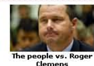
The people vs. Roger Clemens