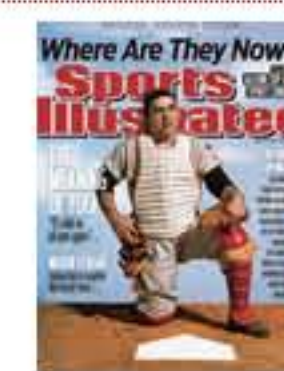
07.04.11 READ ALL ARTICLES BUY COVER REPRINT