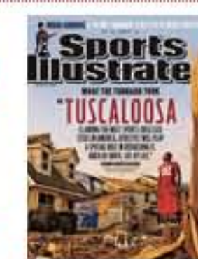
05.23.11 READ ALL ARTICLES BUY COVER REPRINT