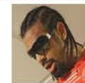
Lane and Weird Excuses