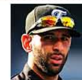
Top MLB All-Star Vote-Getters of All Time